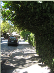
Keeping sidewalks clear of obstructions is important in creating a safe pedestrian environment.