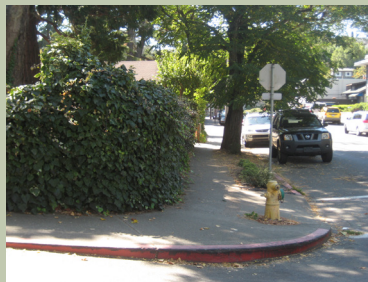
Trees and hedges must be kept properly trimmed in order to maintain a clear view of an intersection.